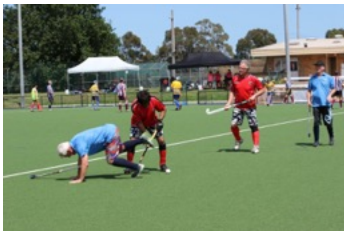
They don't take any prisoners when they get older...

In 2015 we had 4 of our ladies selected to play and 10 of our men selected – all across multiple age groups. So come and join in the fun and challenge of playing for your state